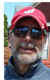
Doug Johnson Properties